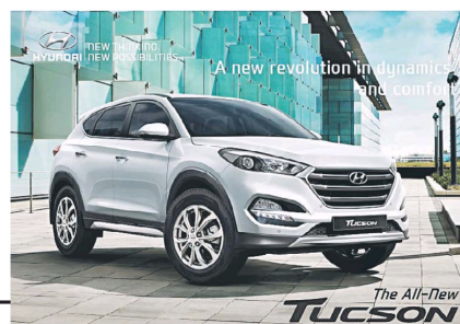
The all-new Tucson from Hyundai.

For more information, call the Rightpower Corporation Sdn Bhd at 084-328698 or 084-316828.