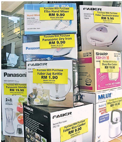
The purchase with purchase items offered at very low price for customers who spend RM1,000 and above.

Those items are Faber Jug kettle at only RM1.90, Milux electric kettle at RM19.90, Faber rice cooker at RM9.90, Sharp rice cooker (RM19.90), Elba hand mixer (RM9.90), Panasonic blender