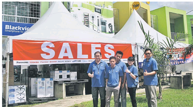
Sales team at the outlet are ever ready to assist customers.

Further enquiries can be made by calling 082-337112, or 013-8038811.