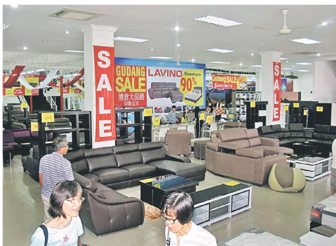
Lavino Batu Kawan warehouse sale is offering up to 90 per cent discount till Nov 29.

can get a set comprising a 8'x8' wardrobe, five-foot bed frame, a dressing table and a side table at only RM1,999.