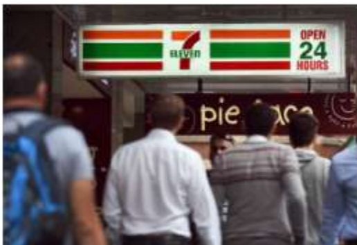
A warning poster would be put up at the premises on the installation of the Safecam. - Pic for illustration purpose only

TAIPING: A total of 150 7-Eleven premises in Perak will be equipped with closed circuit television camera (CCTV) known as 'Safecam' in an effort to reduce crime involving the 24-hour convenience store.